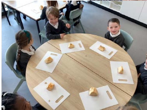
The children enjoyed visiting our Food/Science Room for the first time. They developed their fine motor and cutting skills as well as their descriptive language. They also visited the allotment for the first time to plant their pumpkin seeds!