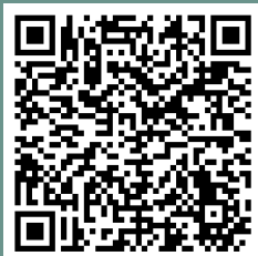
Escalation Process – minimum expectations

Excellent attendance matters to us all. Take a look at information on our website for key documents.