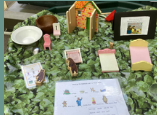
Small world play to re-tell the story