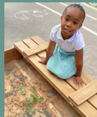
Making a house for the three bears