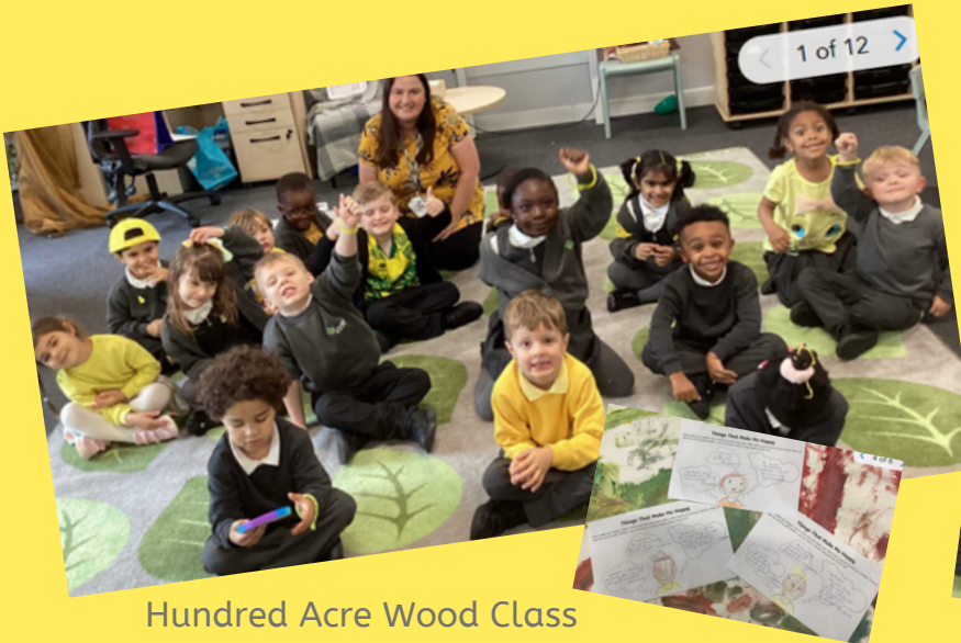
Hundred Acre Wood Class