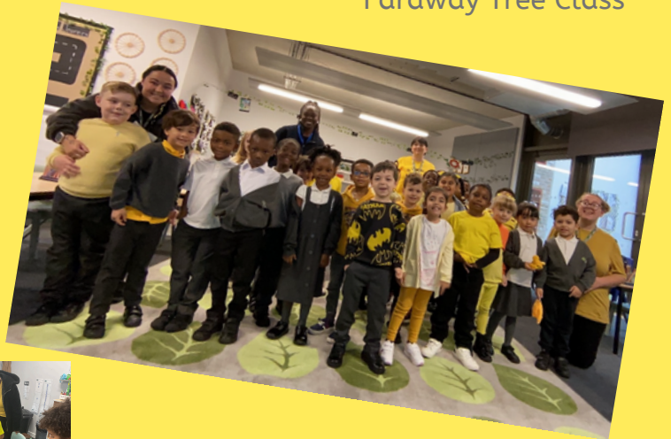
Faraway Tree Class