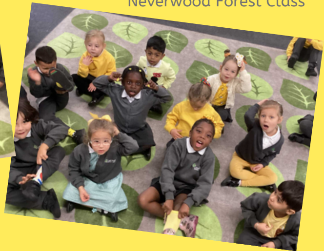
Neverwood Forest Class