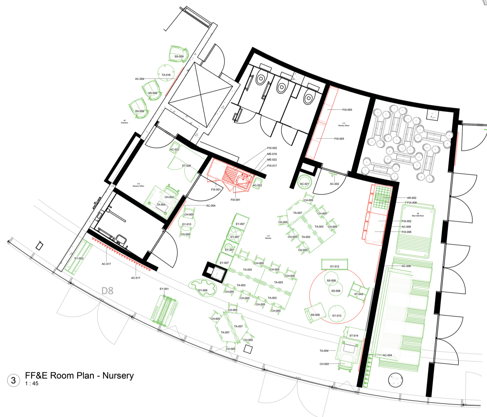
3 FF&E Room Plan - Nursery 1-45