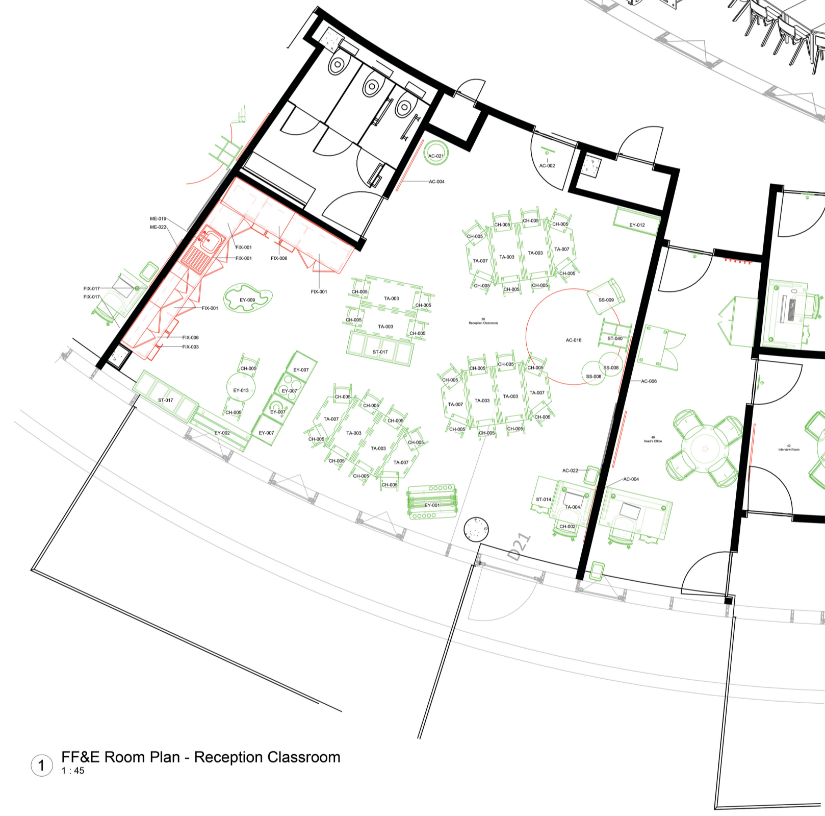
1 FF&E Room Plan - Reception Classroom 1-45